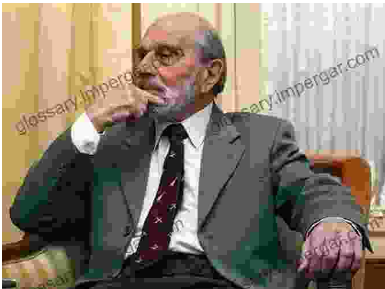
Blake as a Double Agent