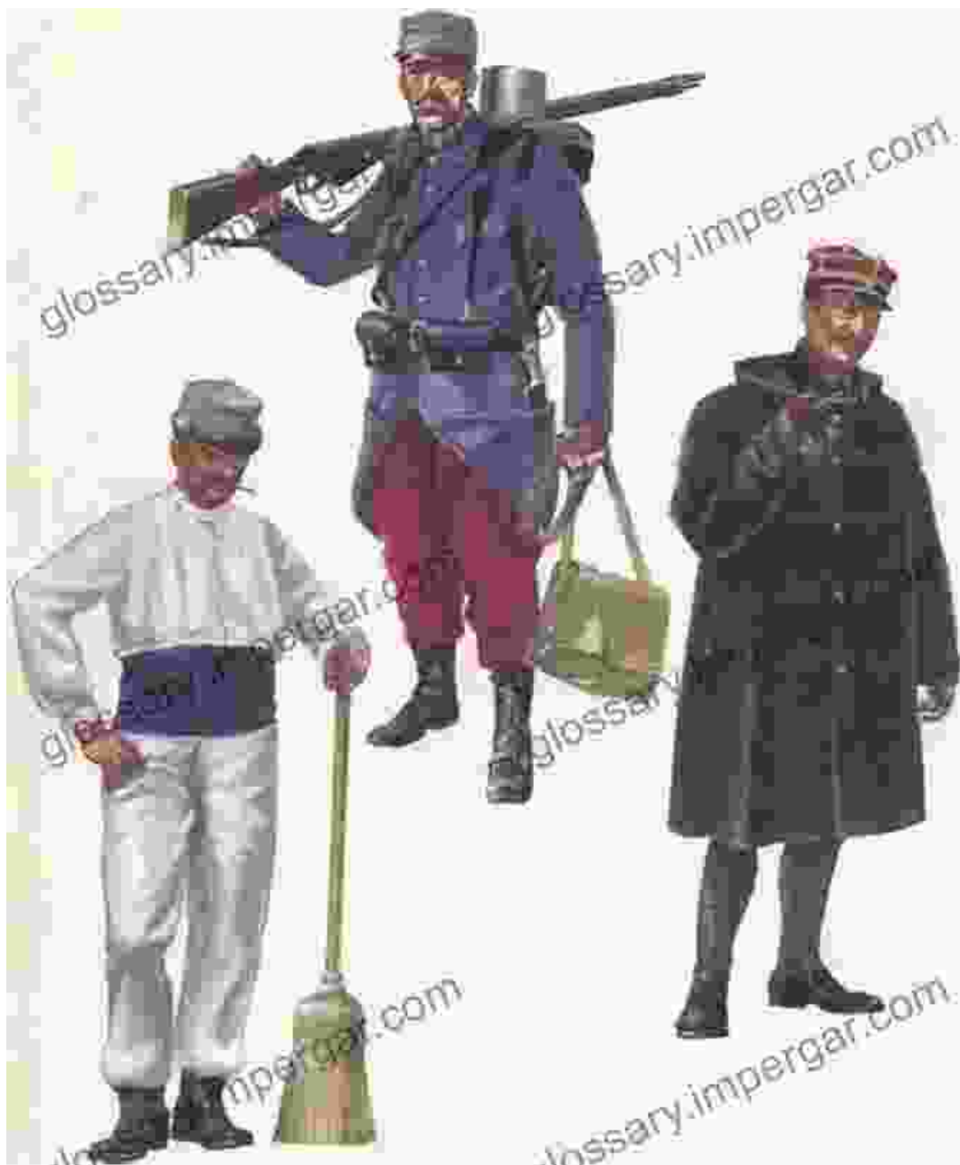
French Foreign Legionnaires in combat during World War I.

account of these campaigns, highlighting the Legion's tactical prowess and the challenges they faced in various theaters of war.